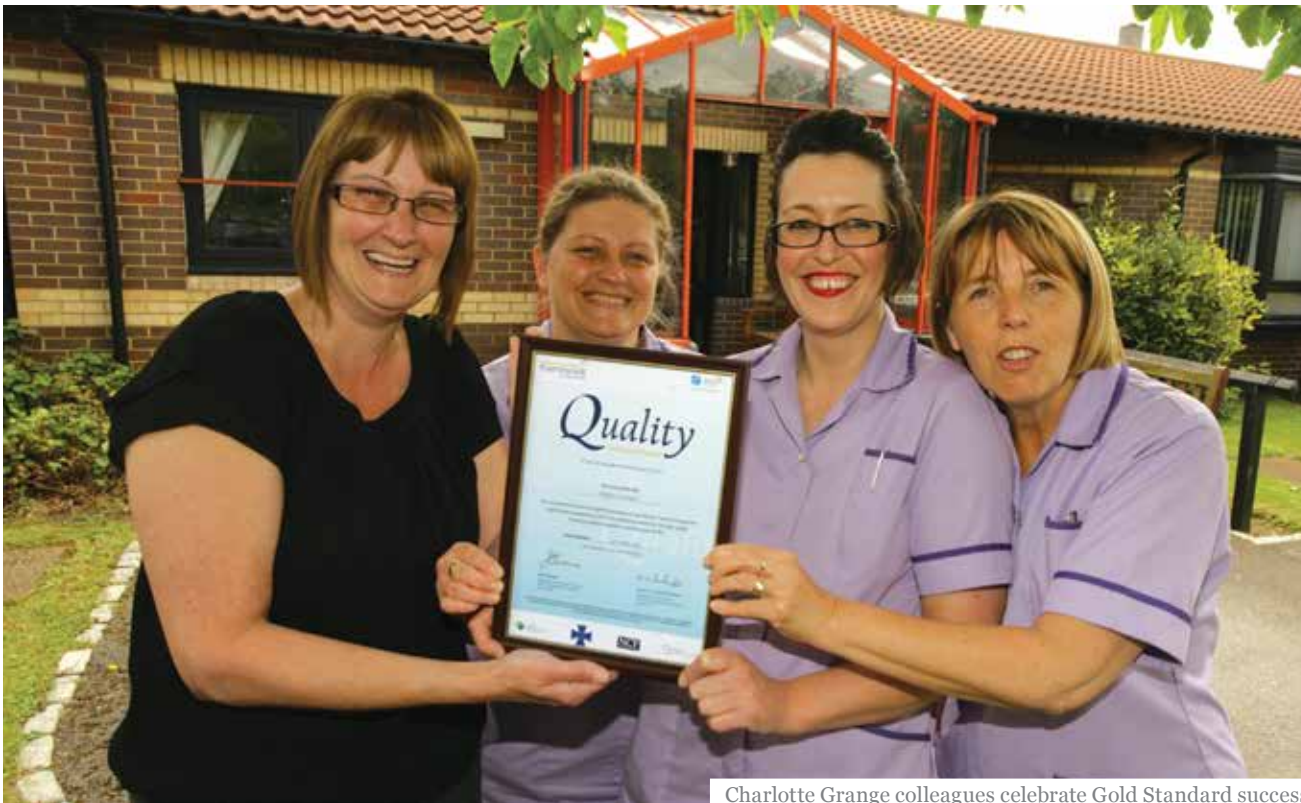
Charlotte Grange colleagues celebrate Gold Standard success

Stirling University is renowned as being one of the UK's academic leaders in the study of dementia care, and this six-part course offered staff at Thorneycroft the opportunity to develop their existing skills and improve their knowledge of dementia, with the support of experts from the University.