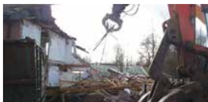
The demolition of Thornlea Care Home

18th April 2011, when the foundations for EachStep Blackley were first laid, was truly a momentous occasion in our history; it didn't just mark another step in the construction of a care service, but a great stride in progressing standards in dementia care.