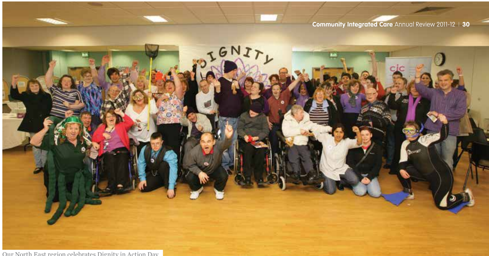
Our North East region celebrates Dignity in Action Day

As one of CIC's core values, dignity is at the heart of all that we do. So this year we were proud to see so many of our staff take up the challenge to support the Department of Health's Dignity in Care Campaign by becoming national 'Dignity Champions' – individual ambassadors who have pledged their support to ensuring that people who need care receive the respect and compassion they deserve.