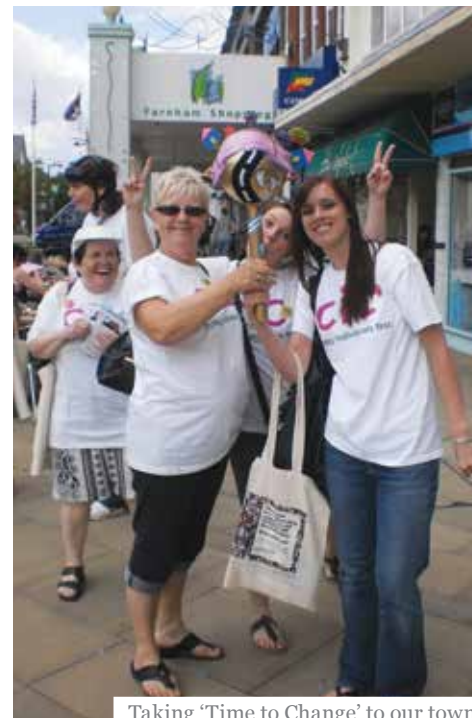
Taking 'Time to Change' to our towns