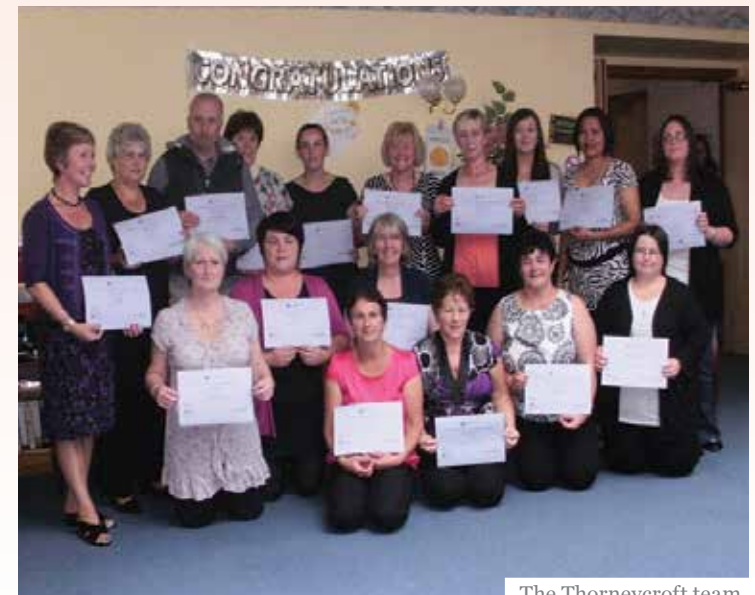
The Thorneycroft team

This accreditation process is endorsed by all major care home organisations, Age UK and the Skills Academy for Social Care. Homes that have received the GSF Quality Hallmark Award have demonstrated a real improvement in the quality of care they provide, halving hospital deaths and crisis admissions, leading to greater satisfaction for families, residents and staff and significant cost savings for the NHS.