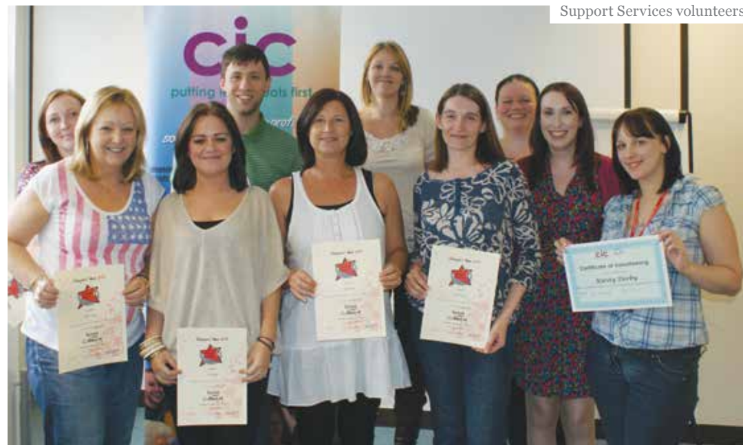
Support Services volunteers

From giving one of our homelessness projects a fresh lick of paint, to building accessible veggie patches for one of our registered care homes, tending service users' allotments to hosting an African drums class, staff from throughout CIC generously donated their time and talents to the volunteer challenges, putting a big smile on many faces along the way.