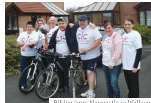
Biking from Newcastle to Wallsend