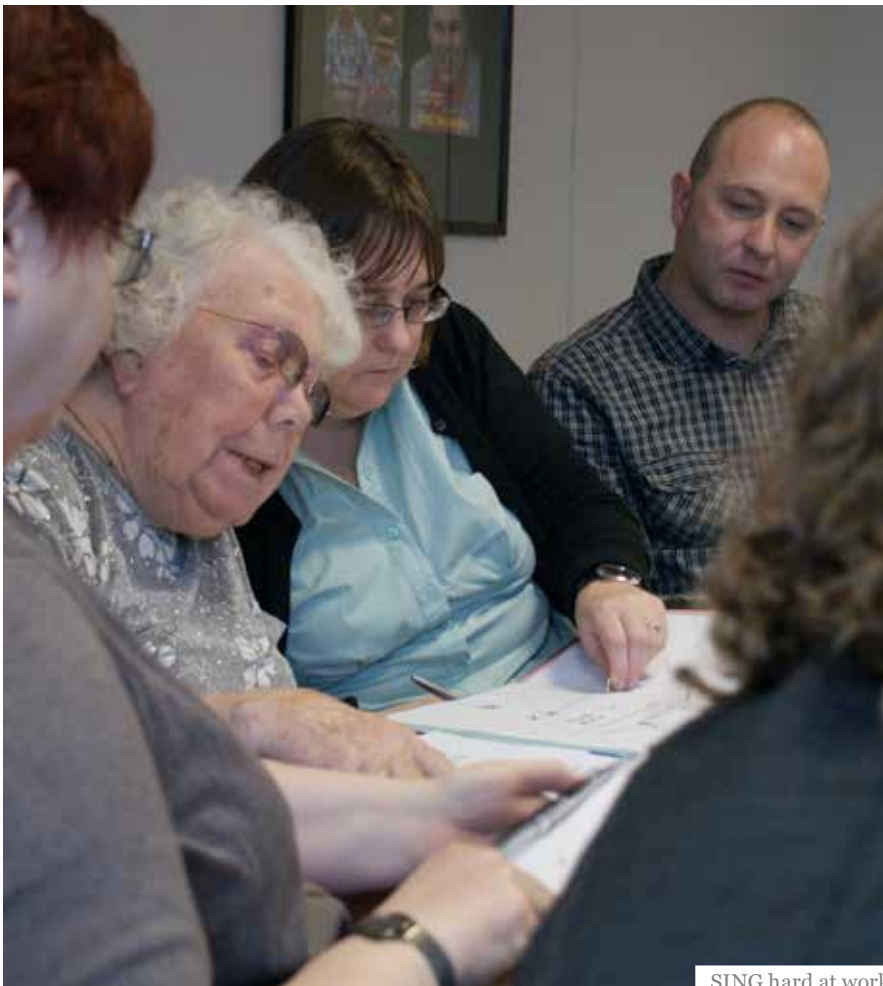
SING hard at work