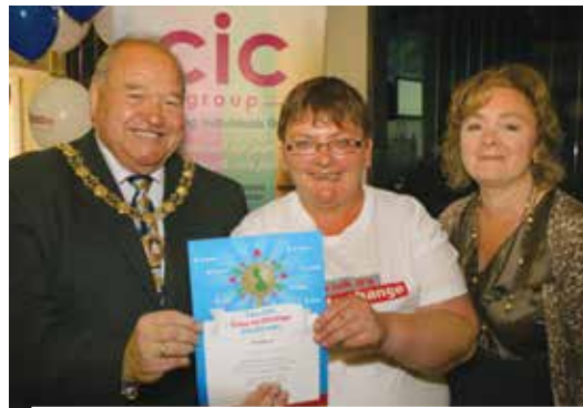
The Mayor of Gateshead shares his congratulations

“The sheer passion, commitment and sense of community shown by everyone who took part in this phenomenal challenge was amazing.”