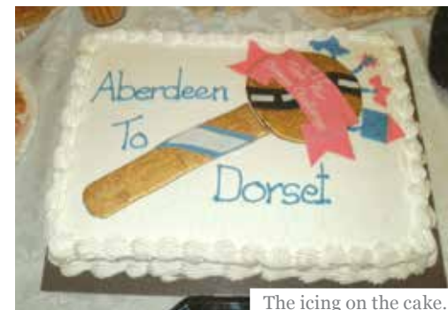
The icing on the cake...