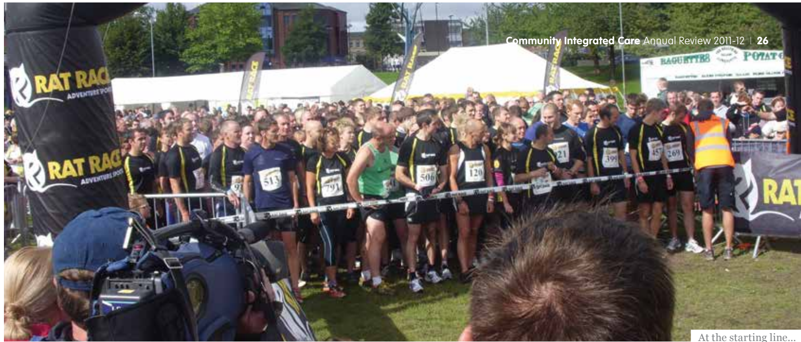
At the starting line...

A NOTORIOUSLY GRUELLING EVENT , with daredevil obstacles at every turn, the 10 kilometre assault course along the banks of the River Tees is certainly not one for the faint hearted. So when five brave Rievaulx students, each paired with a member of Rievaulx staff, signed up to take part, it seemed like mission impossible.