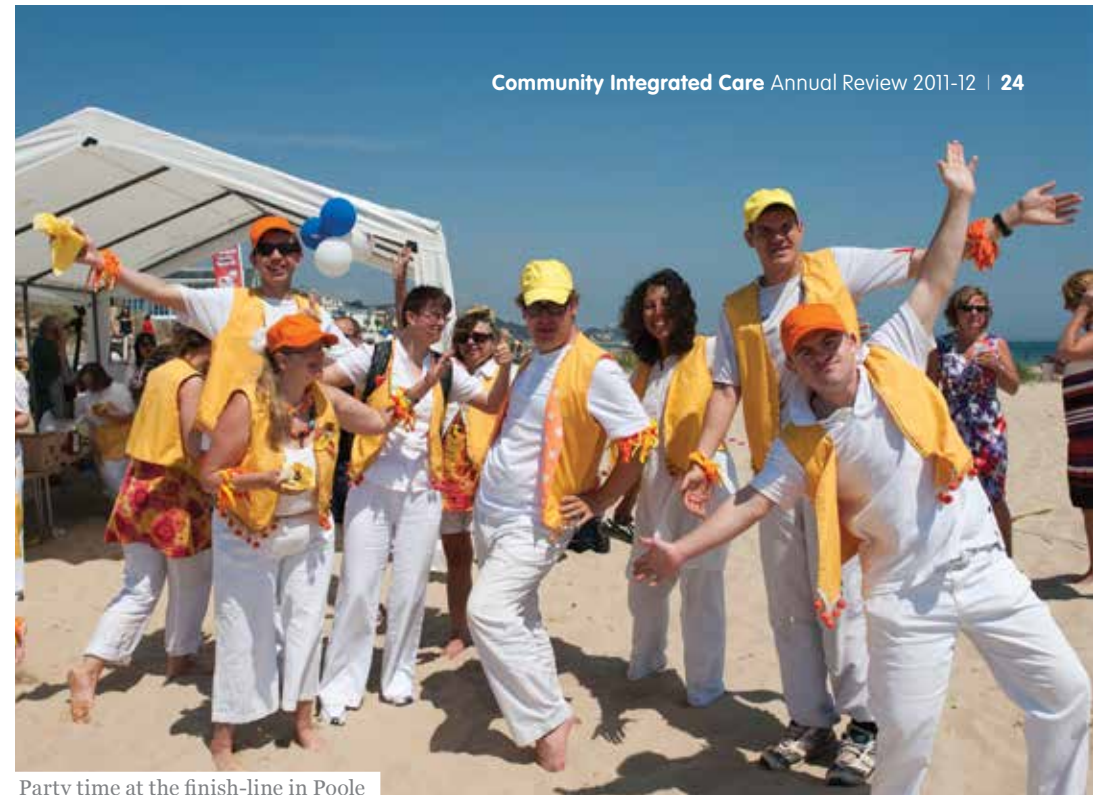
Party time at the finish-line in Poole

“The sheer passion, commitment and sense of community shown by everyone who took part in this phenomenal challenge was amazing.”