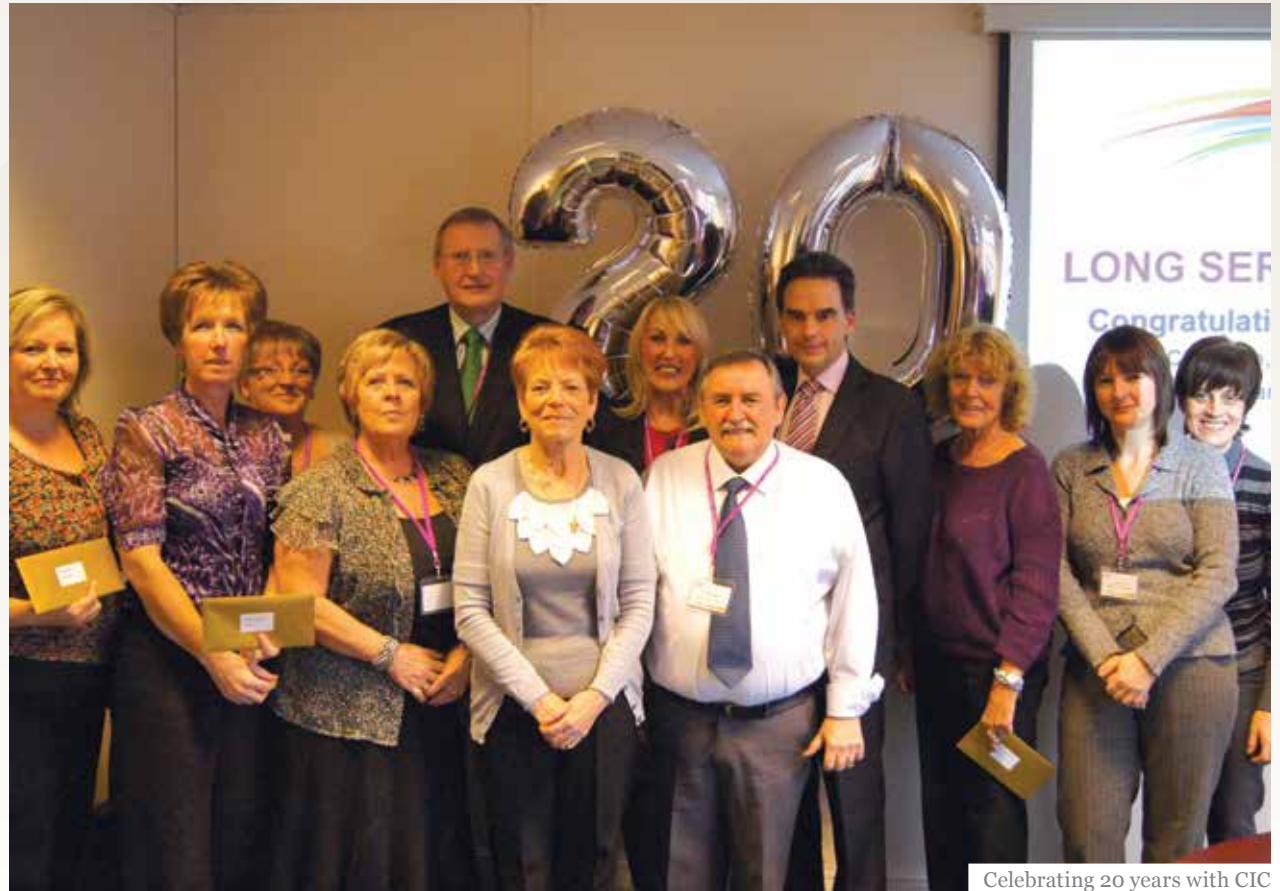
Celebrating 20 years with CIC