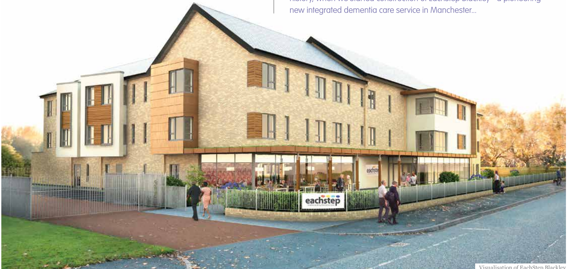
Visualisation of EachStep Blackley