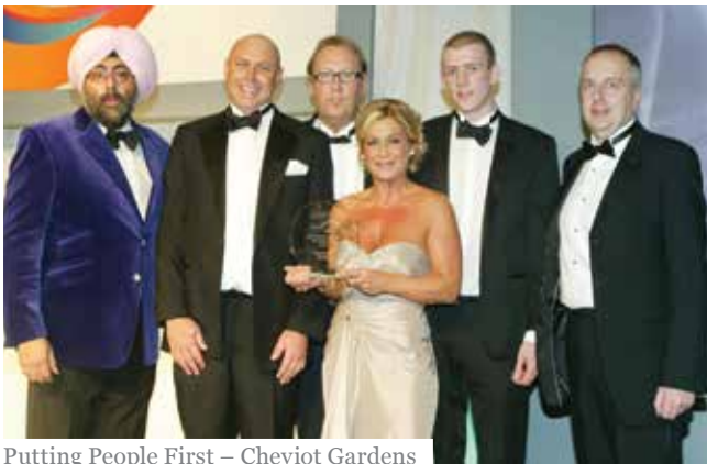
Putting People First – Cheviot Gardens