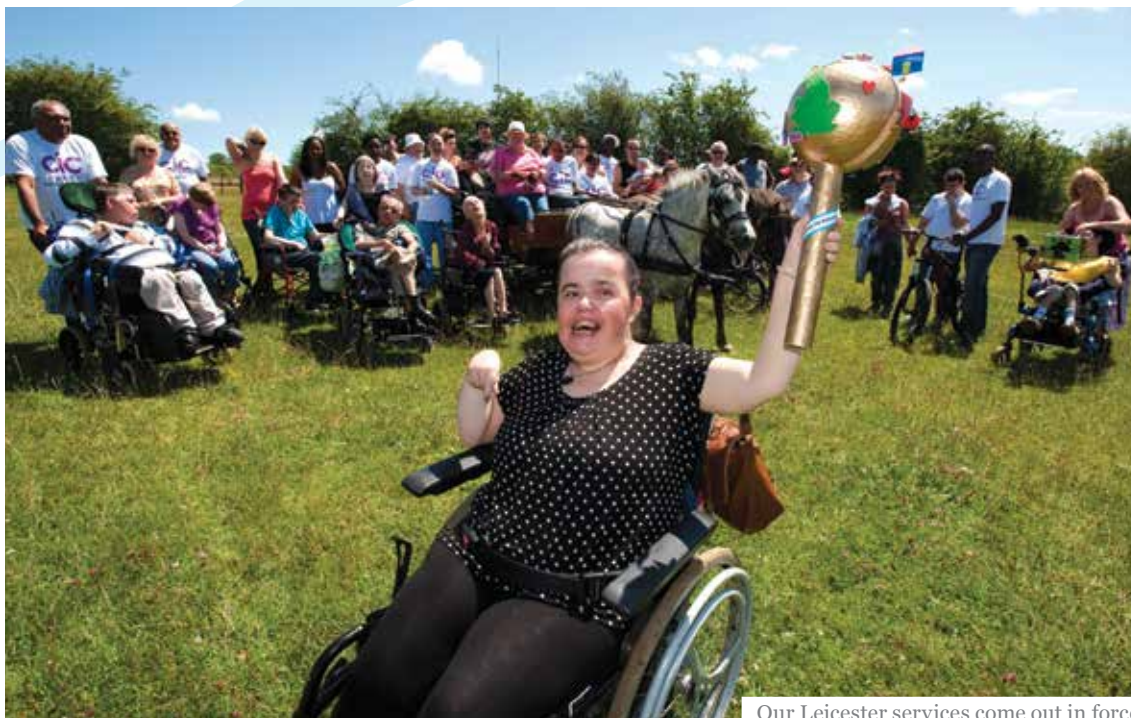
Our Leicester services come out in force

Summer 2011 saw the CIC community come together to take part in one of the biggest events in our 24-year history... The CIC Time to Change Challenge! Organised by staff and service users from across the country, the aim of the challenge was to carry a specially made baton 600 miles down Britain by any means possible, raising awareness of the national mental health campaign, Time to Change.