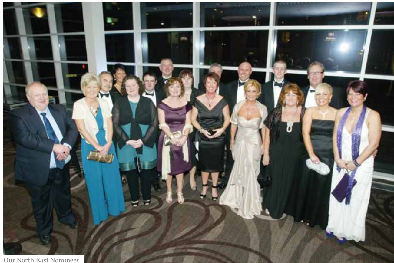
Our North East Nominees

OUR SUCCESS in delivering innovative and quality services is reflected in the many care awards we won, and were nominated for, in 2011. From champion chefs to marvellous managers, we've got a lot to be proud of!