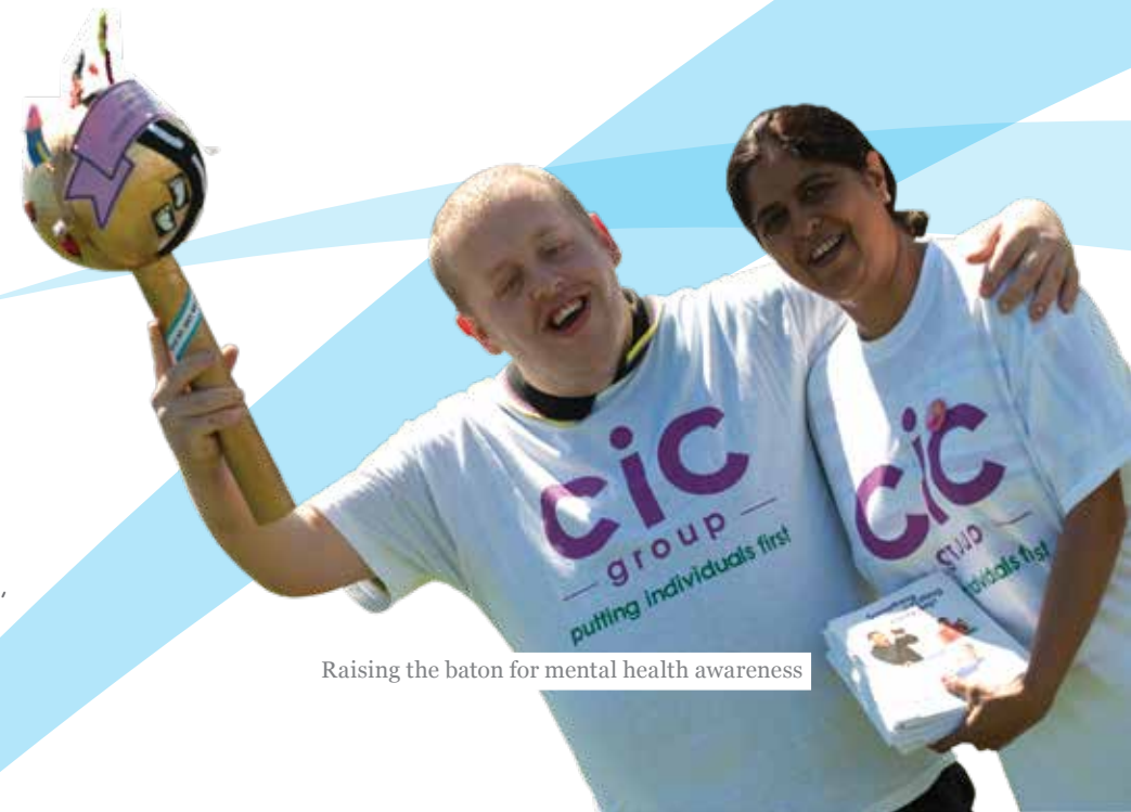
Raising the baton for mental health awareness