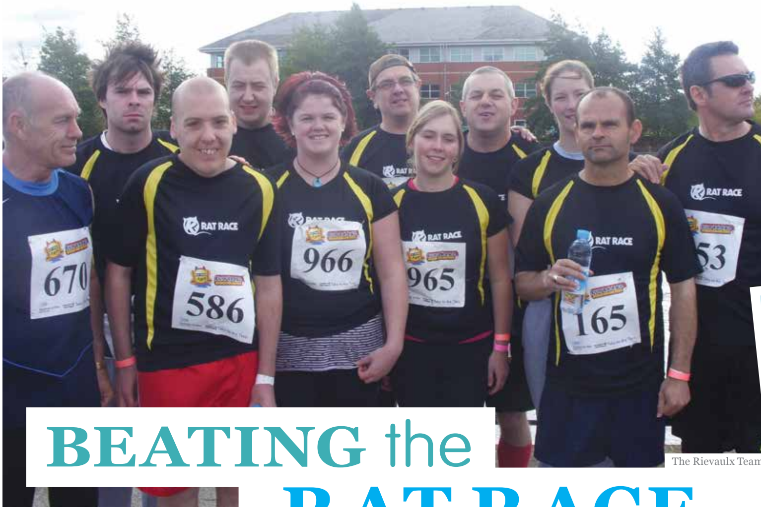
The Rievaulx Team