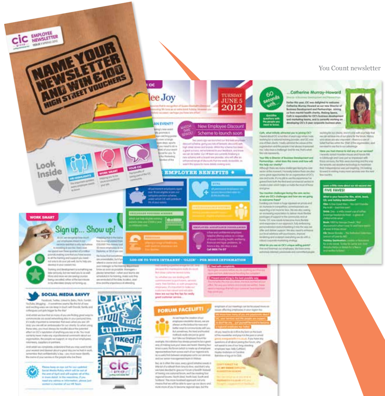
You Count newsletter

Grace concludes: "The publication, which is filled with all the necessary updates for employee life at CIC, has already become a firm favourite amongst staff, with lots of great feedback and suggestions for features flooding in. It's been fantastic to see the overwhelmingly positive feedback to the launch and is proof, if any was needed, of the real impact that good, thoughtful employee communication can have."