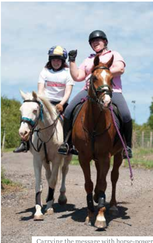
Carrying the message with horse-power